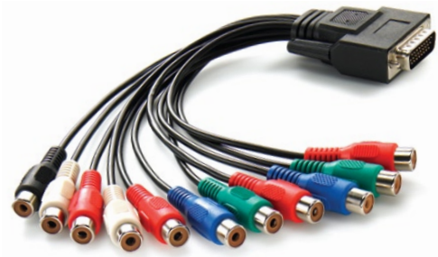
Breakout Cable (Analog video and audio connections)